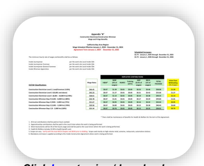
Click <u>here</u> to view/download new wage schedule.

Under that Agreement, the newly bargained for rate applies to the Construction Electrician Level 2, and other classifications apply from that point on a percentage basis. On January 1, 2024, there will be a $2.75/hour increase to the CE2, moving the wage rate from $39.48 to $42.23. In addition, there will be an increase in the Health contribution of $0.16/hour bringing the total cost increase to $2.91 for 2024. Lower classifications are scaled down from that point. In January of 2025 and January of 2026, there will be additional increases of $2.75/hour. There is a maintenance of benefits provision for the Health Plan so the actual increase for 2025 and 2026 will likely be somewhat higher.