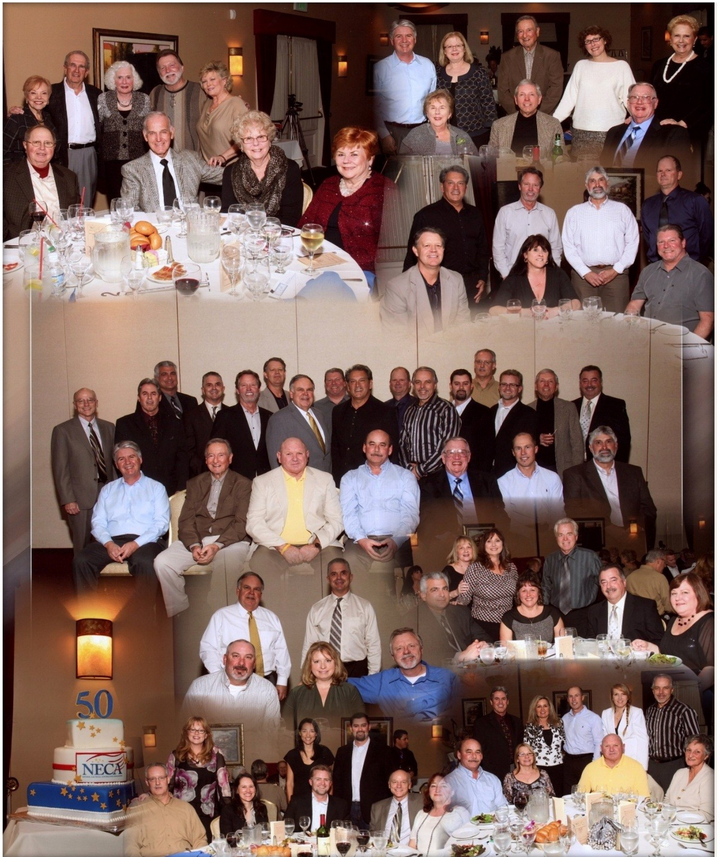
Contra Costa Chapter, NECA Chapter Membership Meeting January 31, 2013